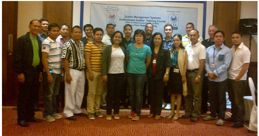
Managers, consultants and QMS practitioners gather for Lead Auditor training.